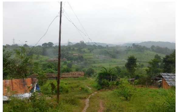
An Electric Pole