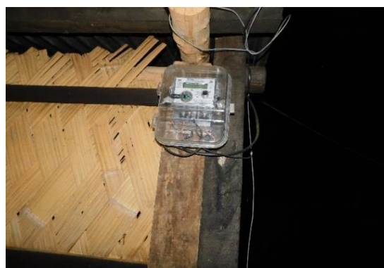
Post paid Electric Meter