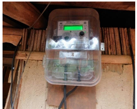
Post paid Electric Meter