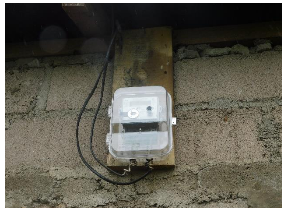
Post paid Electric Meter