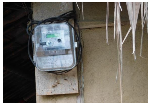
Post paid Electric Meter