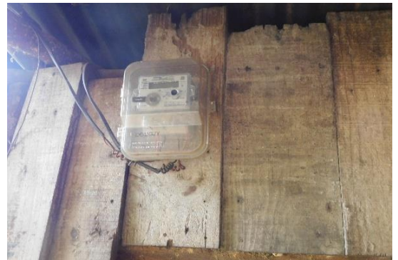
Post paid Electric Meter