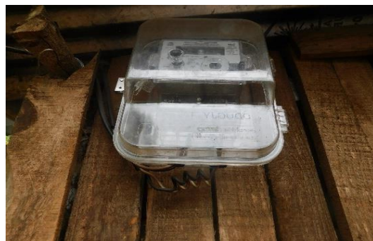
Post Paid Electric Meter