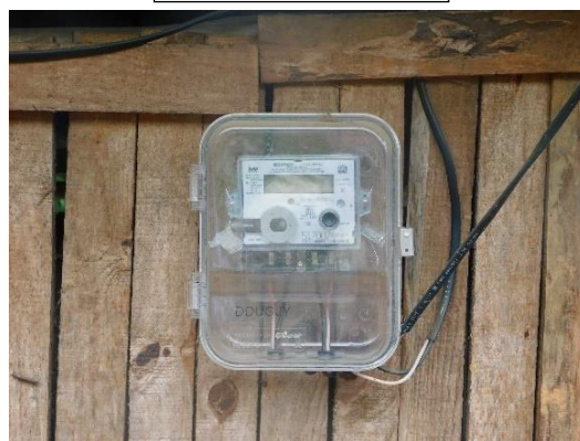
Post paid Electric Meter