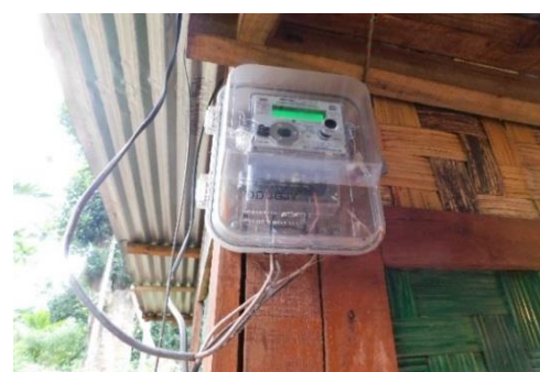
Post paid Electric Meter