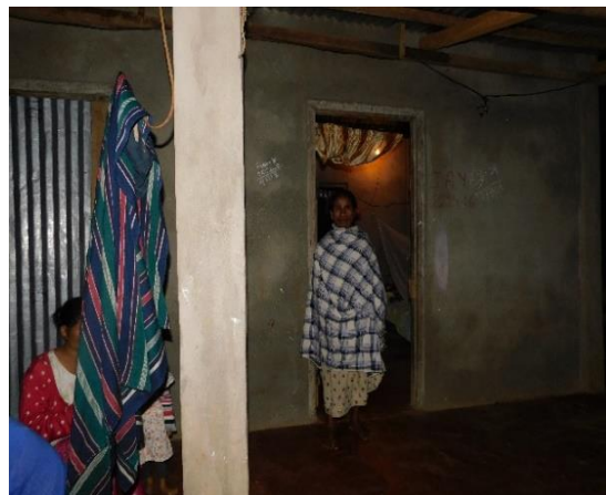
Post paid Electric Meter