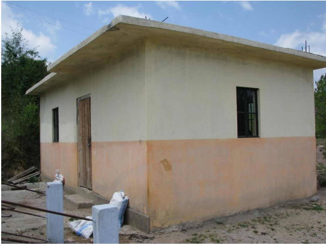
Kitchen shed for Mid Day Meal.

All problems related with Mid Day Meal may be brought to the notice of the District School Education Officer, Mawkyrwat so as to find out the solution.