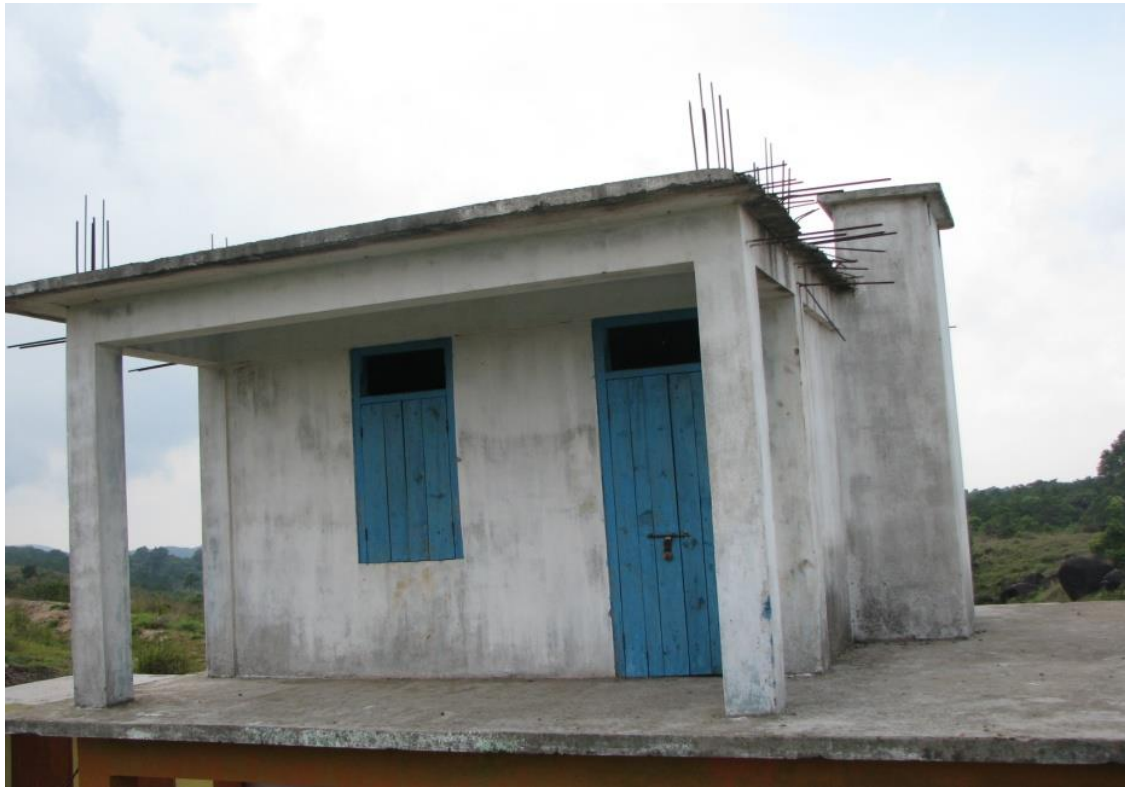
Kitchen shed constructed under Mid Day Meal