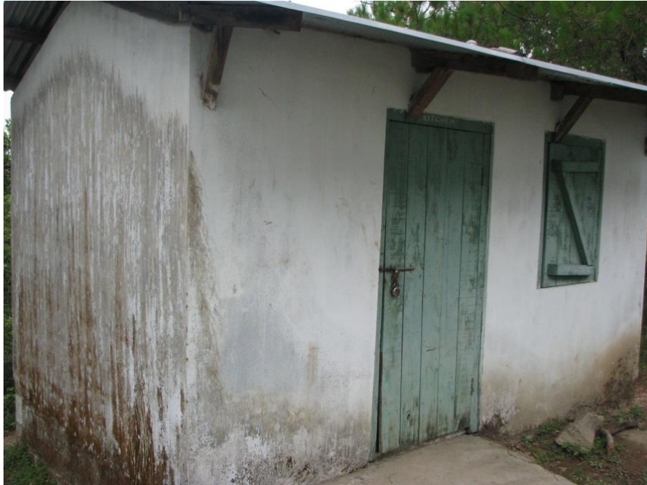
Kitchen shed for Mid Day Meal