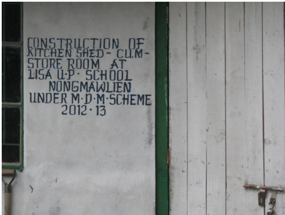
Kitchen shed cum store room under Mid Day Meal Scheme.