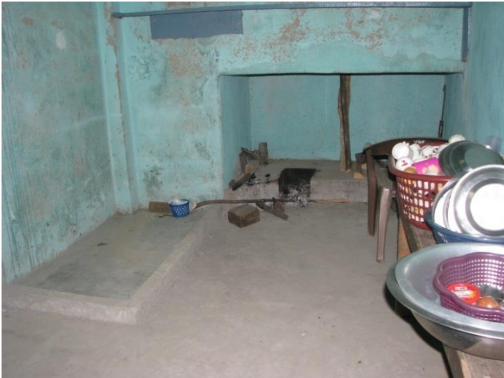
Kitchen shed and utensils for Mid Day Meal