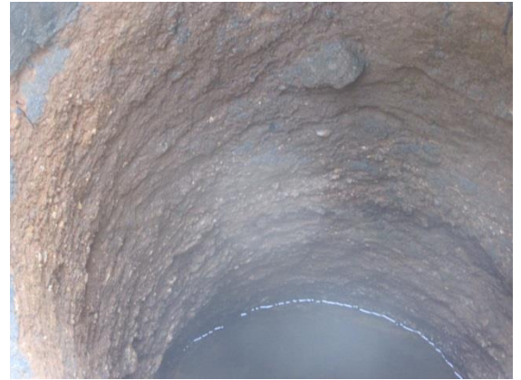
The inner part of a Ringwell