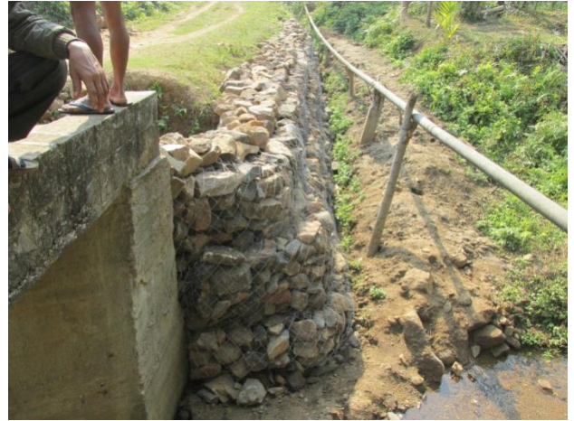
A retaining wall