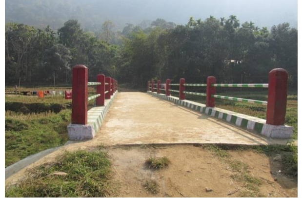
A single lane RCC bridge