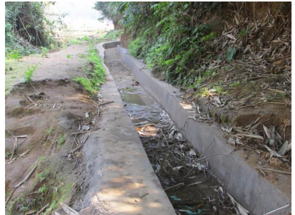
A C.C. Check Dam