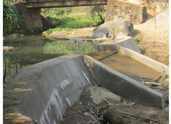
A CC Check Dam

20. Suggestions:- The APO i/c was advised to erect a sign board at the site of the CC check dam.