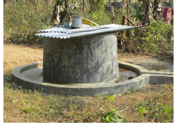
The outer part of a Ringwell