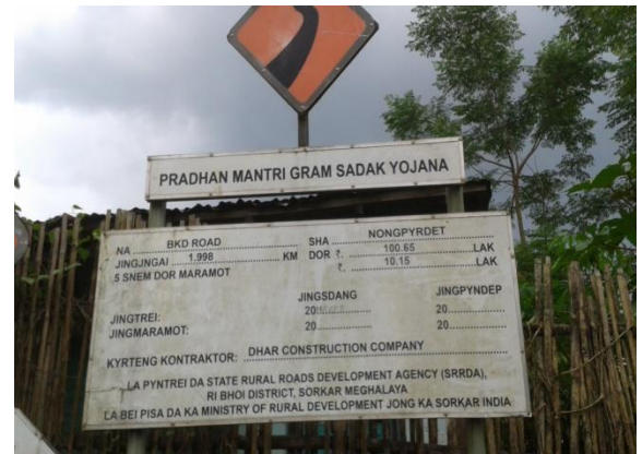
Sign Board of the road

19) Suggestions:- The AEE, i/c was advised to complete the remaining work as early as possible so that the same will be fully completed.