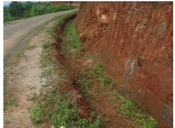
Side Drain of the Road