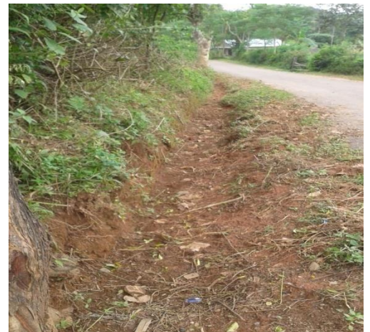
Side Drain of the road