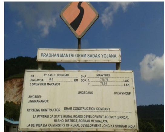
Sign Board of the road

19) Observation/findings:- The inspection team found that the construction of the road is 95% completed and Black Topping has been done. The only remaining work to be done are the furniture signs which will be carried out shortly.