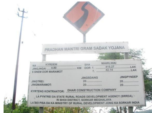
Sign board of the road

18) Observations/findings:- It was found that only earth cutting of the road has been completed. On the day of inspection it was observed that no labourers are present at the site and on enquiry about the absence of labourers the AEE incharge informed that due to monsoon the work has been temporarily stopped and the same will be resumed soon after the end of the monsoon.