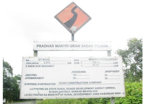
Sign Board of the road

19) Suggestions:- The AEE, incharge was advised to complete the remaining work immediately after the end of monsoon so that the work will be fully completed.