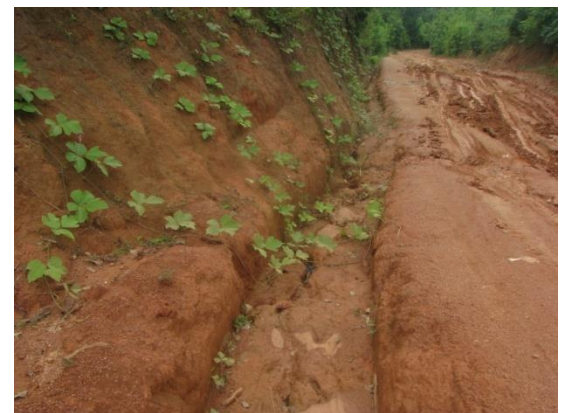
Side Drain of the road