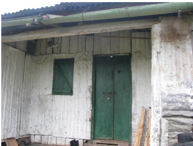
Smt. Kiloris Shangrit

Following are the photographs of some of the beneficiaries taken on the date of inspection:-