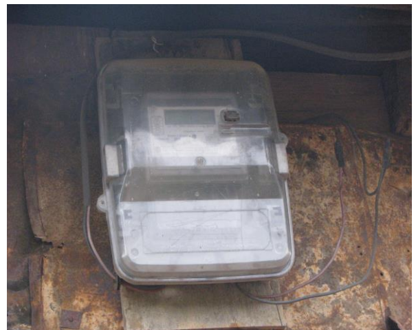
Shri laishah Byrsat