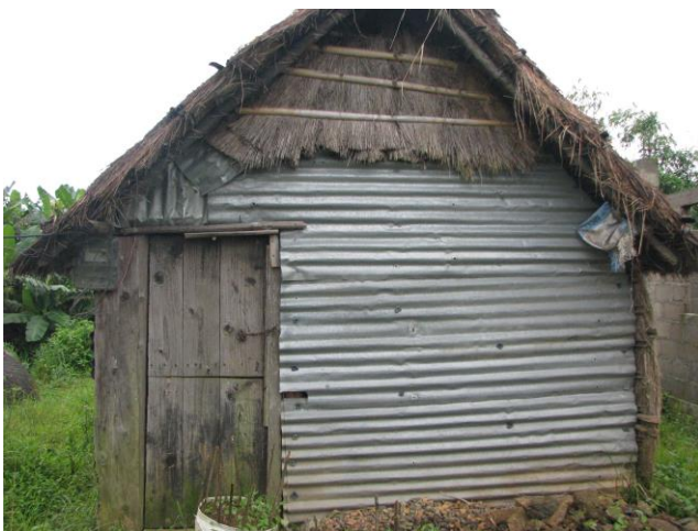
Smt Mersiful Dkhar