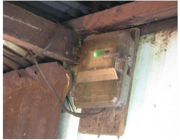
Smt Lucky Dkhar