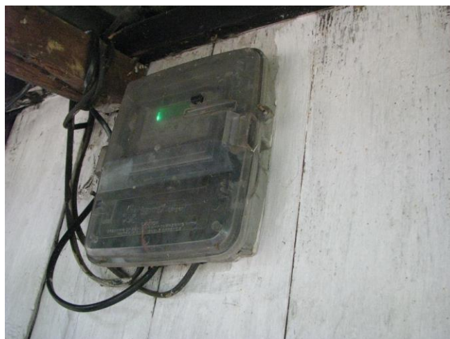
Shri Strongpillar Syiemlieh