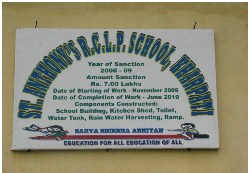
School Building and toilets constructed under SSA

The matter relating to the appointment of non-teaching assistance has to be arranged by the Managing Committee since there is no provision of this facility under SSA. However, the school may avail the facilities of getting financial assistance for school uniform from SSA.