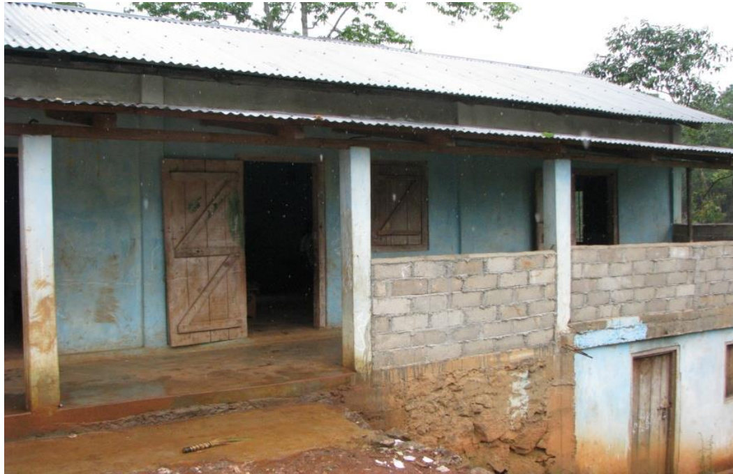
Building and toilets constructed under SSA assistance

The Managing Committee may approach the office of PHE Nongpoh to get water connection since the source is just a little away from the school. For renovation and making of partitions the school may request the SSA authority to enhance the Maintenance Grant.