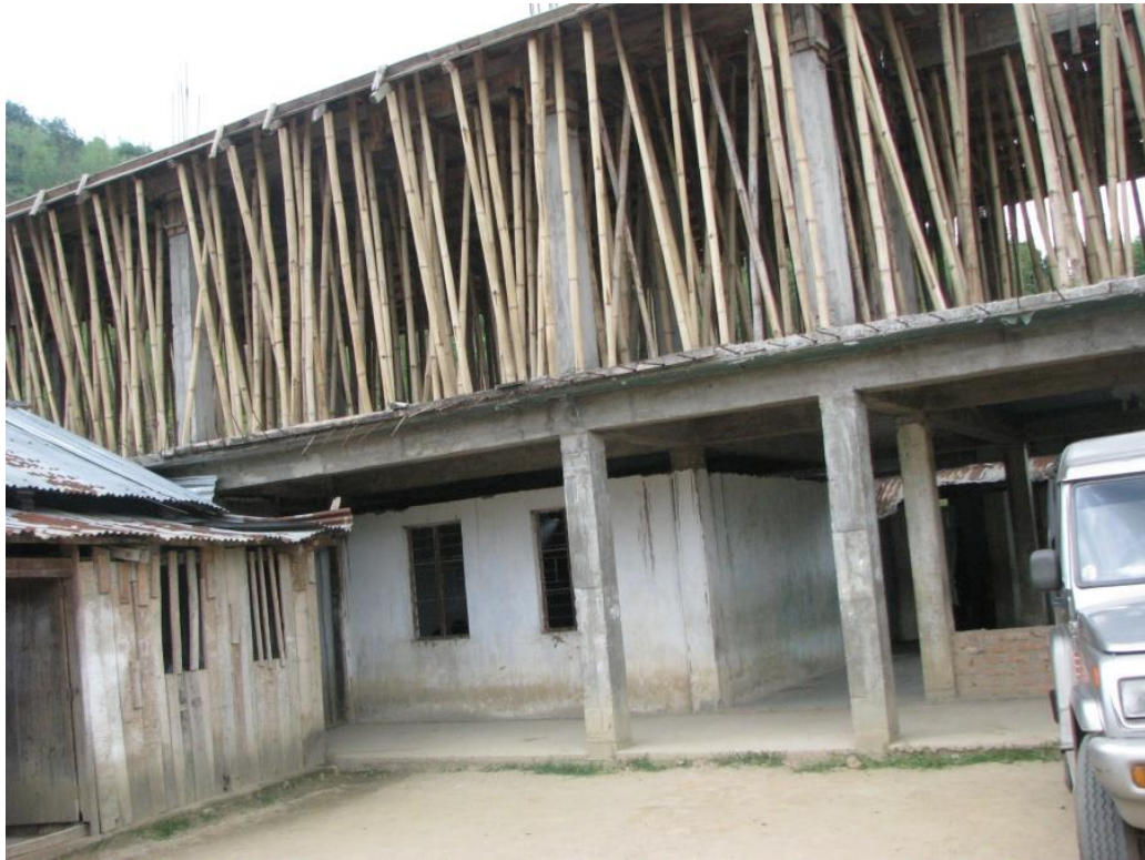
Ongoing construction of School Building