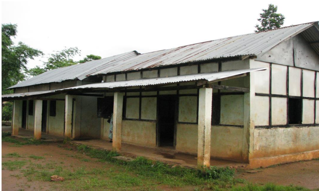
School Building and toilets constructed under SSA.

The Managing Committee may approach SSA authority for getting financial assistance to construct additional school building and making partition for separation of classrooms. As for fencing the school may find out assistance from other sources. So also for getting assistance for school uniforms for the students.