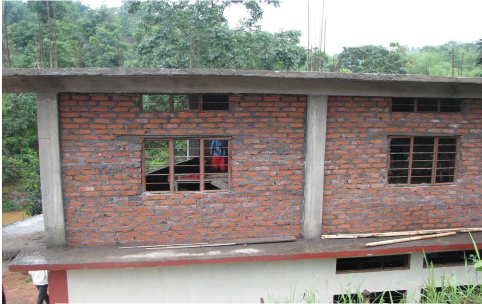
Construction of the School Building in progress.

Immediate collection of orders issued by SSA in connection with financial assistance for uniforms, etc. need to be entrusted on the Secretary/ etc. of the Managing Committee as delay in obtaining of order from SSA may result in cancellation and deprivation of assistance.