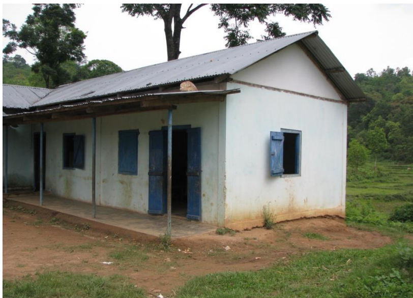
School Building constructed under SSA

The Managing Committee need to contact the District Mission Coordinator for conducting immediate inspection of the building so as to assess the actual dilapidated condition and provide additional financial assistance for renovation and partition of classrooms.