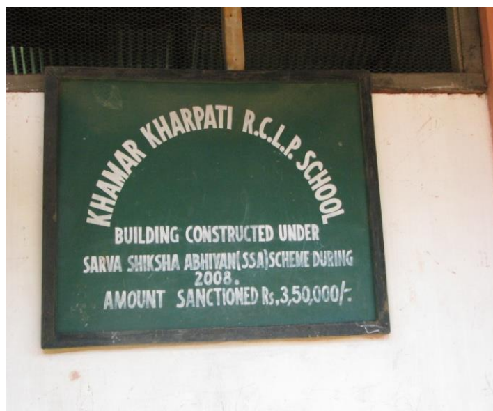
School Building constructed under SSA

To solve the problem of drinking water supply the Managing Committee may seek assistance from SSA as water reservoir of the locality is very near to the school and only water connection is required. So also for additional building and computer facilities.