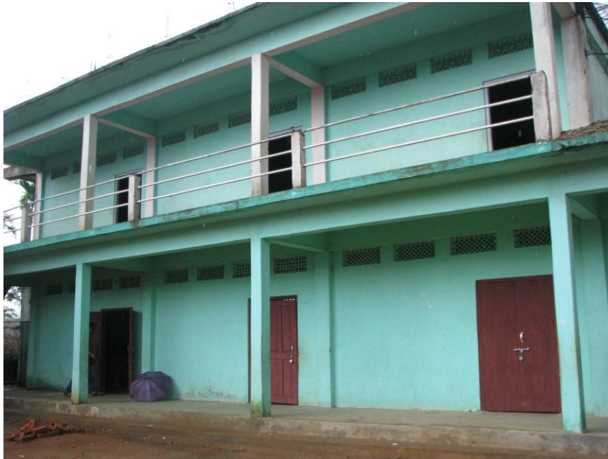
Three Rooms on the Upper floor of the School Building are constructed under SSA Scheme.

To examine the possibility of getting computer facility from SSA. Proposal for enhancement of maintenance grant with proper justification may be submitted to SSA for consideration.