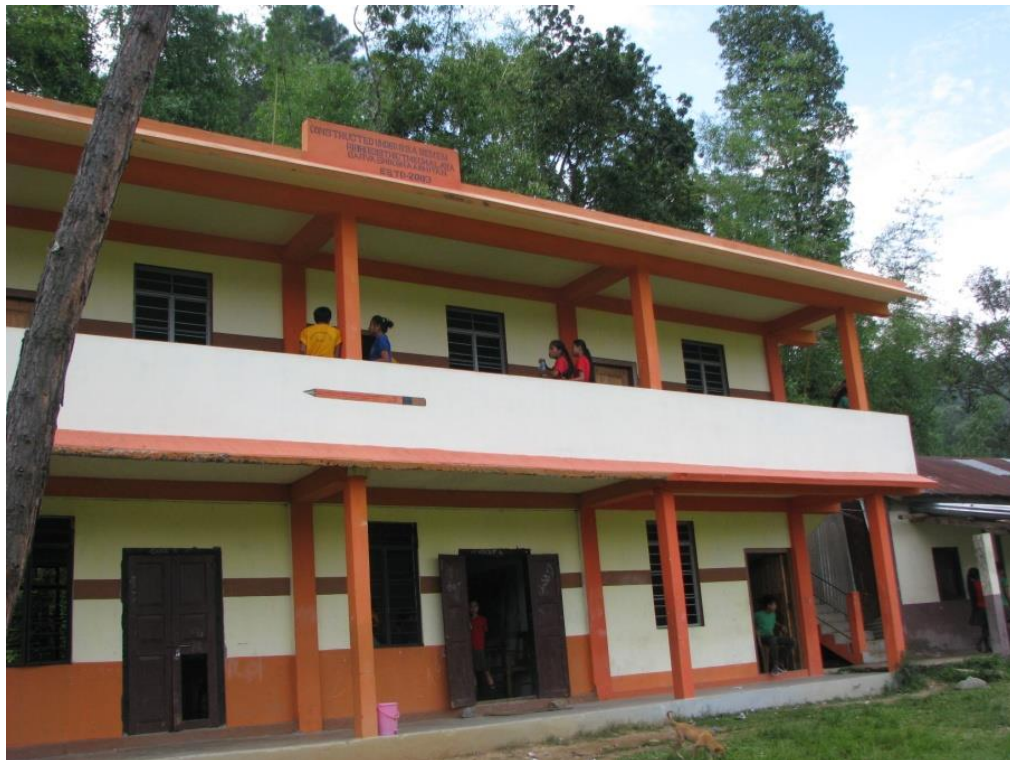
Upper floor of the School Building is constructed under SSA Scheme.

The Managing Committee may examine the possibility of getting water supply from the PHE department.