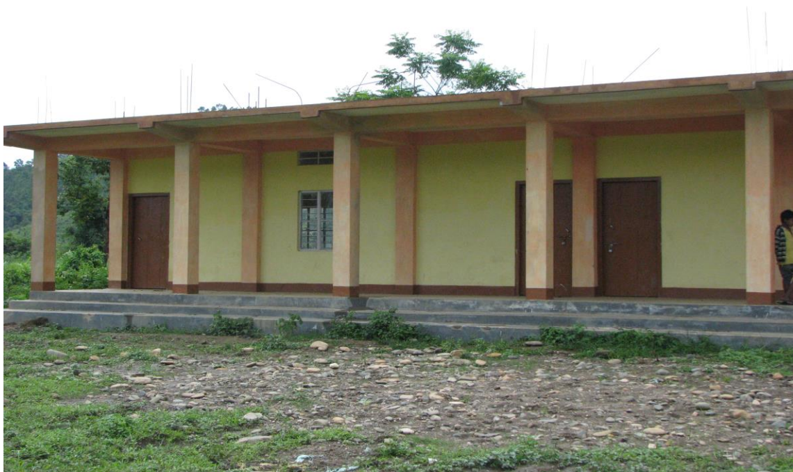
School Building constructed under SSA assistance.

The Managing Committee needs to approach the District Mission Coordinator for providing maintenance grant, computer facility and school uniforms.