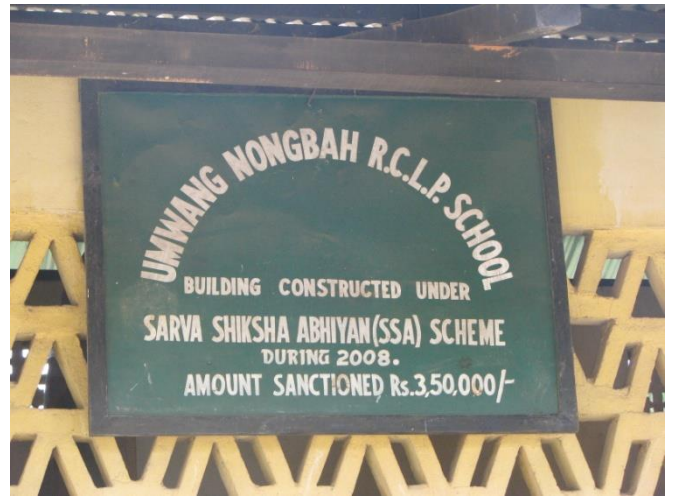
School Building and toilets constructed under SSA