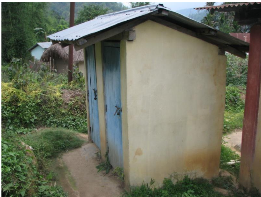
SARVA SHIKSHA ABHIYAN SCHEME (SSA)